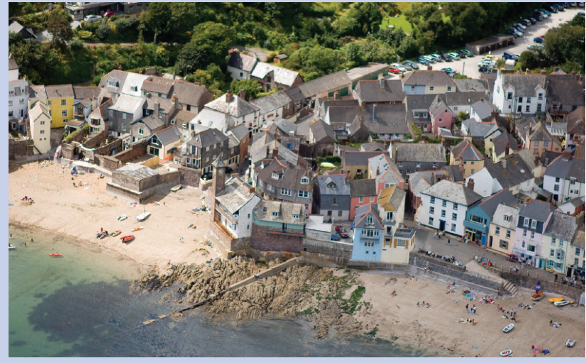
Cawsand to the left, Kingsand to the right. The former has always been in Cornwall but the latter was once in Devon. Fish cellars were built in Kingsand for the landing and processing of fish so the duties that were payable in Plymouth could be evaded.